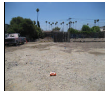
Site Current Conditions