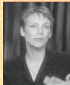
Jamie Lee Curtis